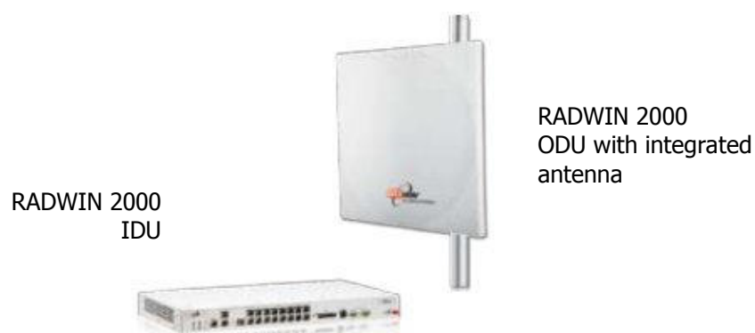
RADWIN 2000 Microwave Link for Unlicensed Bands

RADWIN's ( www.radwin.com ) RADWIN 2000 is a prime example of a state-of-the-art point-to-point microwave link for unlicensed-band operation: